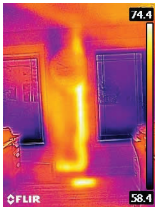
Warm Drain Pipe in Wall