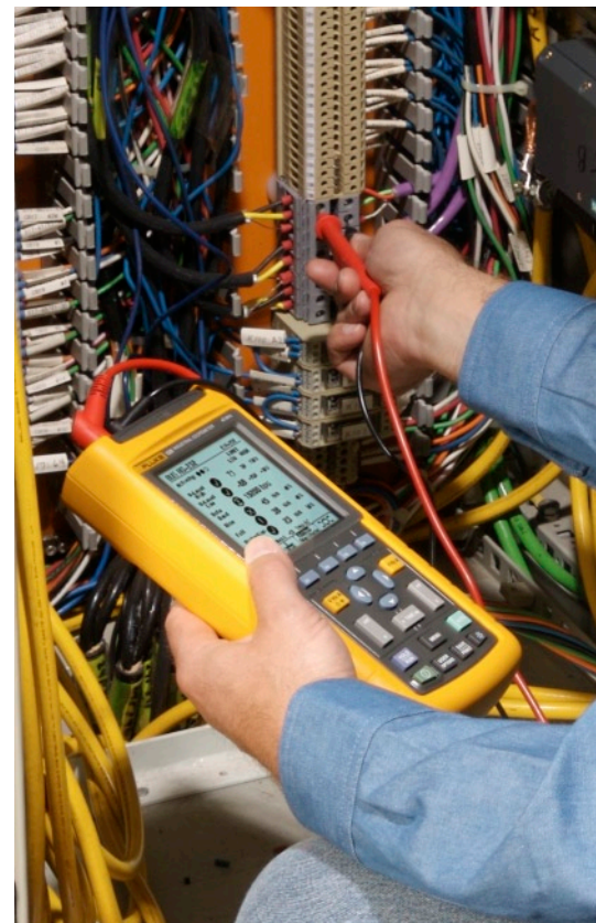
Using the automatic network-test function on the Fluke 125 ScopeMeter® Test Tool.

Besides the three basic network problems mentioned above, backbones are also prone to configuration errors that usually fall into the information technology (IT) domain. Finally, the management level controller may experience configuration or other problems.