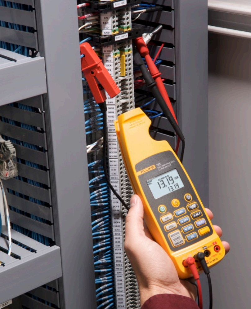
Figure 3. The Fluke 773 Milliamper Clamp Meter includes both milliamper and low voltage measurement and sourcing.

The Fluke 773 Process Milliamper Clamp Meter can both measure the milliamper signal as well as source the 4–20 mA and 1–5 or 0–10 V signals.