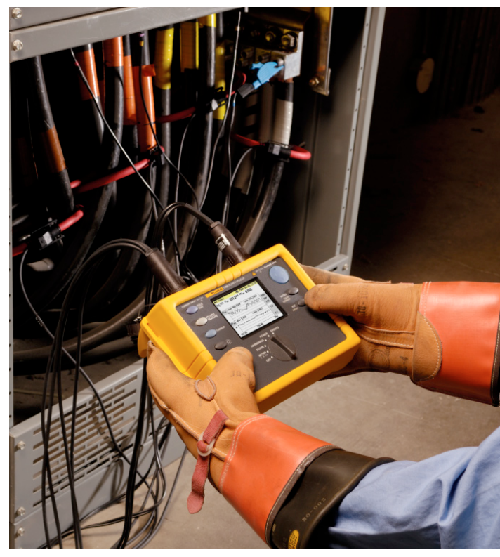
A three-phase power logger can measure demand over time, which can help identify areas where companies can cut energy costs.

Twite compares using a thermal imager (infrared camera) in energy auditing to your doctor's use of a stethoscope during an annual checkup: "If you go in for a physical exam, the first tool the